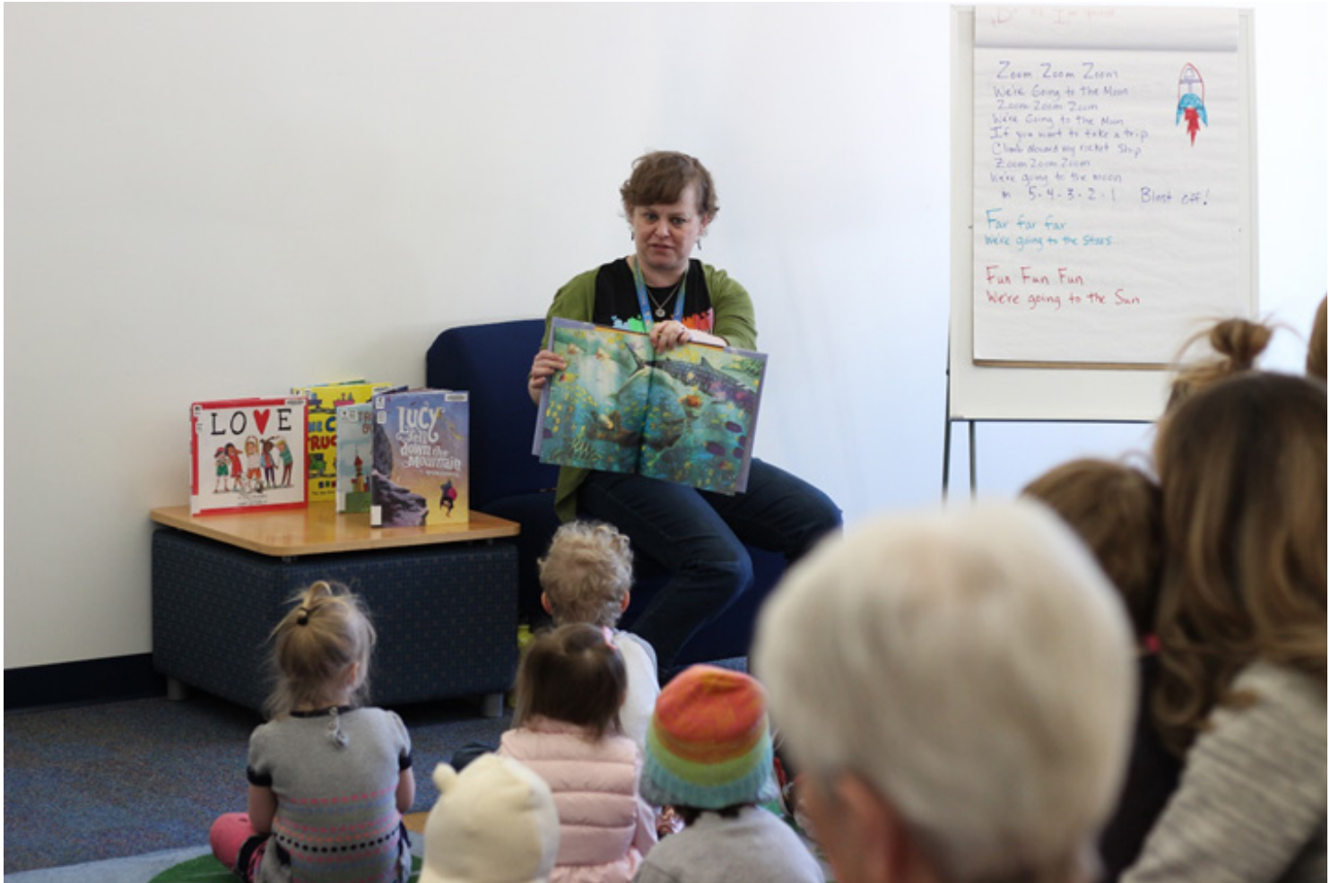
Kids sit down on the rug to listen to stories.